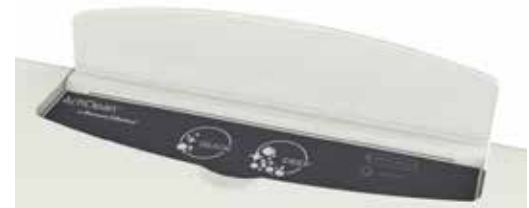
SELF-CLEANING TANK TOP DEVICE

SEE REVERSE FOR ADDITIONAL ROUGHING-IN DIMENSIONS