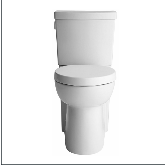
2794 119 Shown